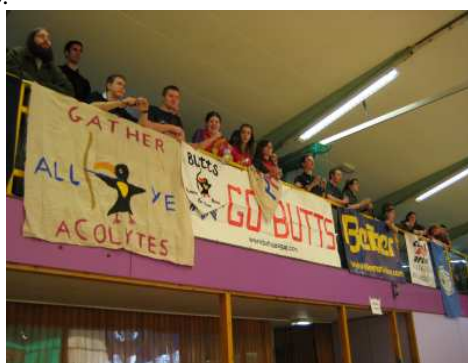
Banners at BUTC