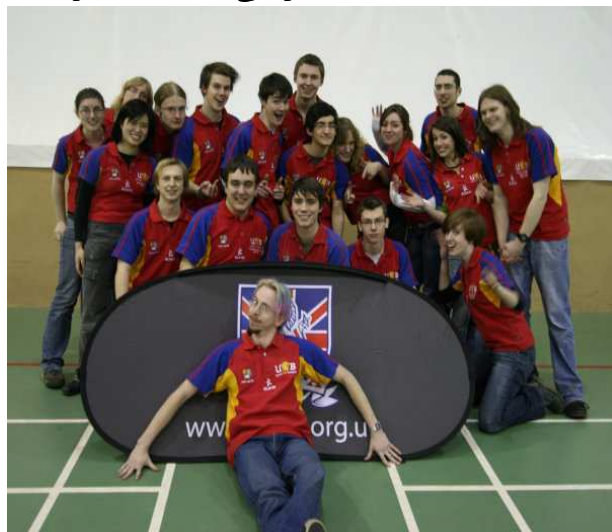
The team at BUSA